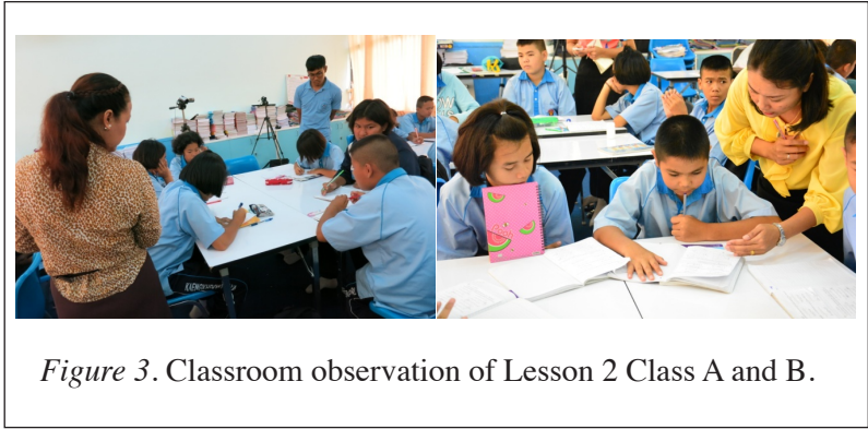
Figure 3. Classroom observation of Lesson 2 Class A and B.

“Some students had difficulty in using the basic symbol to represent the perpendicular lines. I can know whether my students can do whatever that I set for learning target or not.” (Teacher B)