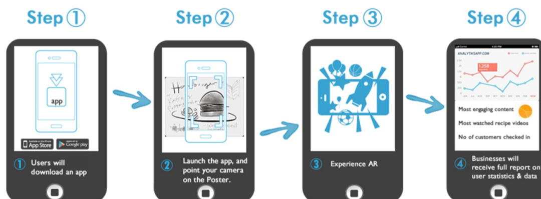
Figure 1: Steps to experience AR

their camera on the trigger image provided in the teaching material, they immediately can view the overlay such as the video on how to solve the tutorial question that prepared by their lecturer.