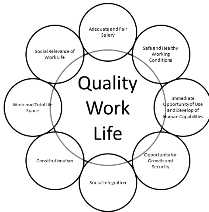
Figure 2.1: Walton's quality work life model

capacities, social integration in the work organization, constitutionalism in the work organization, work and total life space and social relevance of work life (Refer Figure 2.1).