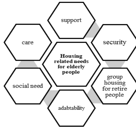
Figure 1 Housing related needs for Elderly in Malaysia (Peace, 2002)

To ensure the welfare of ageing population, there is a remarkable need for a well-developed strategic planning at the government level and among centres operators. There is a need to opt some innovative techniques to overcome the ageing population issues such as promoting the new approaches, systems, products and technologies that accelerate the care process of ageing population (Syed et al., 2012; Cohoon et al., 2010; Mohd et al., 2015; Samad et al., 2017), for their better life standard as elderly population in Malaysia are confronting various health, non-health and societal issues. Below mentioned the discussion on issues of elderly population in Malaysia.