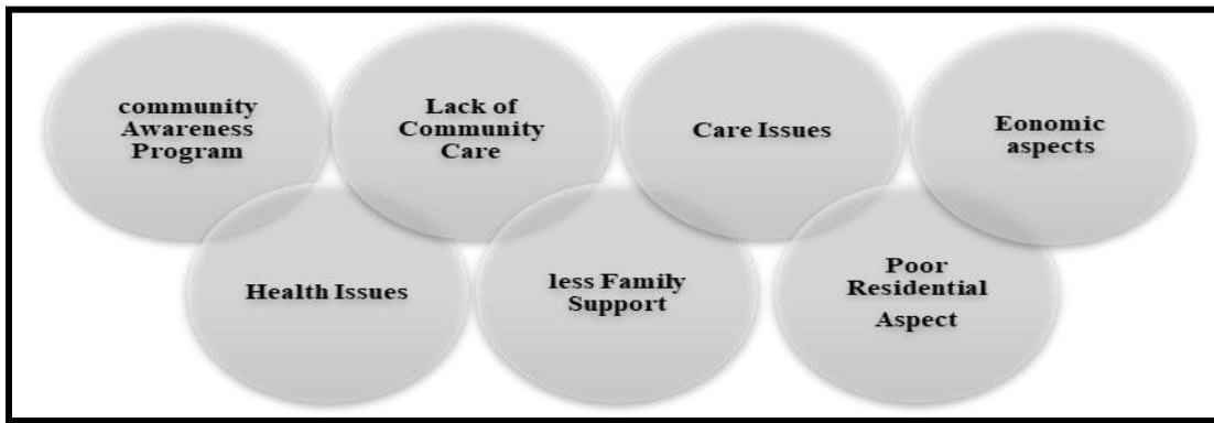
Figure 2 Obstacles confronted by Ageing Population in Malaysia (Researcher's adaptation from Literature)

In order to overcome the issues of ageing population, Malaysia requires policy revision specifically in place of the ageing population; and there is a dire need to involve the private sector as a partner, and develop strong linkages between policy planners, administrators, services implementer, researchers, formal and informal care system, older and young individuals, and most probably the women entrepreneur who comprises of half of population of Malaysia, and owned 15% of businesses in Malaysia. Thus, women entrepreneur entry in ageing centres business will bring a drastic change in care centre business, country progress, and empowerment of women (Vannucci et al., 2017; ACP, 2018).