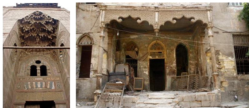
Figure 2: Sample of Decorative Elements in The Courtyard