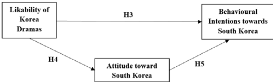
Figure 3. Conceptual model for likability of Korean dramas

Cohen (1988) has suggested that R 2 value of 0.02, 0.13 and 0.26 indicated weak, moderated and substantial level of predictive accuracy respectively. Table 5 showed that viewing of Korean dramas and attitude toward South Korea have substantial level of predictive accuracy, explaining 30.7% (R 2 = 0.307) of the variance of behavioral intentions toward South Korea. Meanwhile, the predictive relevance and effect size were reported in Table 5 and Table 6 respectively.