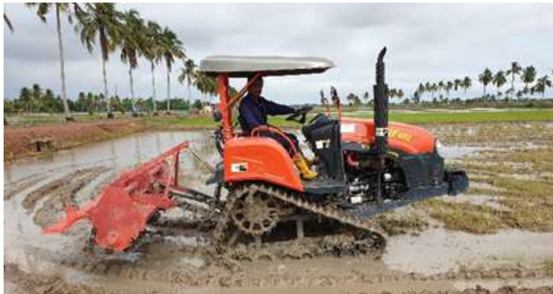
Figure 1. The triangular rubber tracked tractor attached with a rotary tiller.