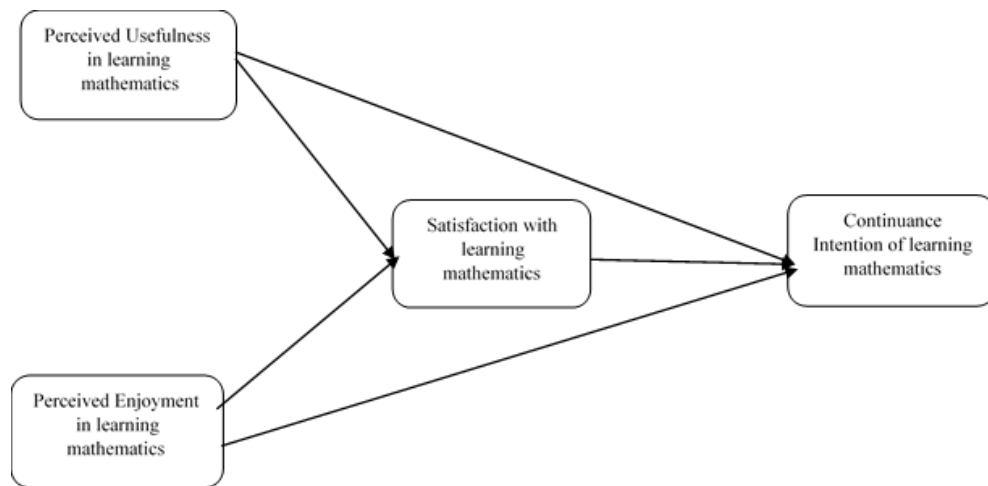
Fig. 1. Proposed research model

The research model was created using Bhattacharjee's (2001) IS continuance intention and adding the construct of perceived enjoyment, as seen in Figure 1. The variables examined in this research include satisfaction with learning mathematics, perceived usefulness in learning mathematics, perceived enjoyment in learning mathematics, and continuance intention of learning mathematics. Based on the theoretical background, five hypotheses were proposed.