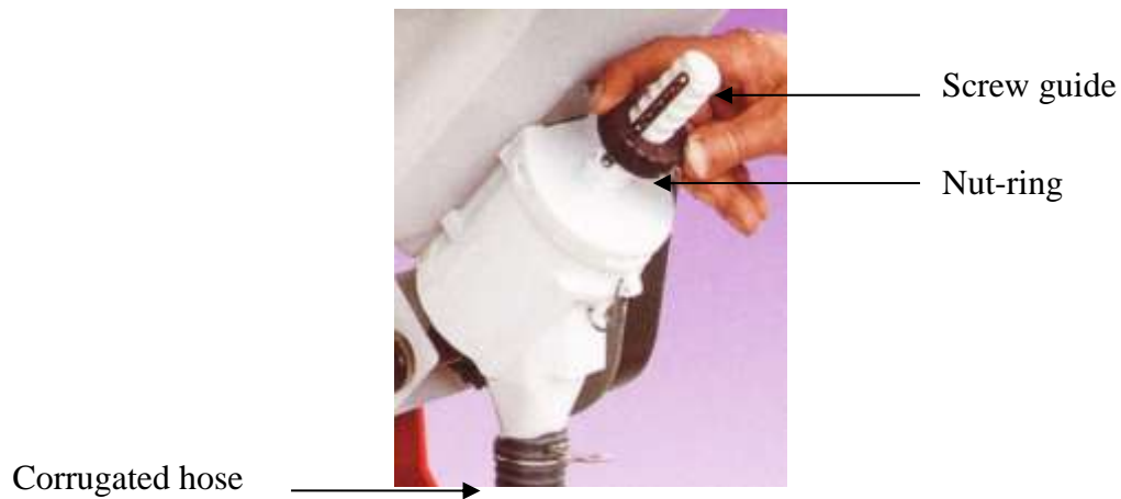
Figure 2. Fertiliser metering device