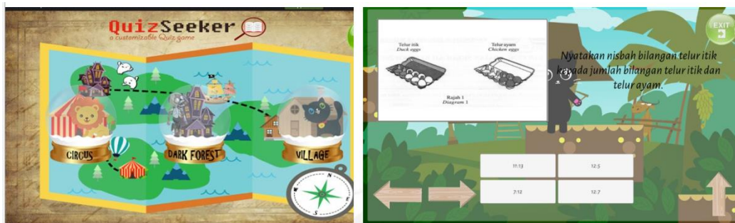
Fig. 1. Predecessor product (Version 1).