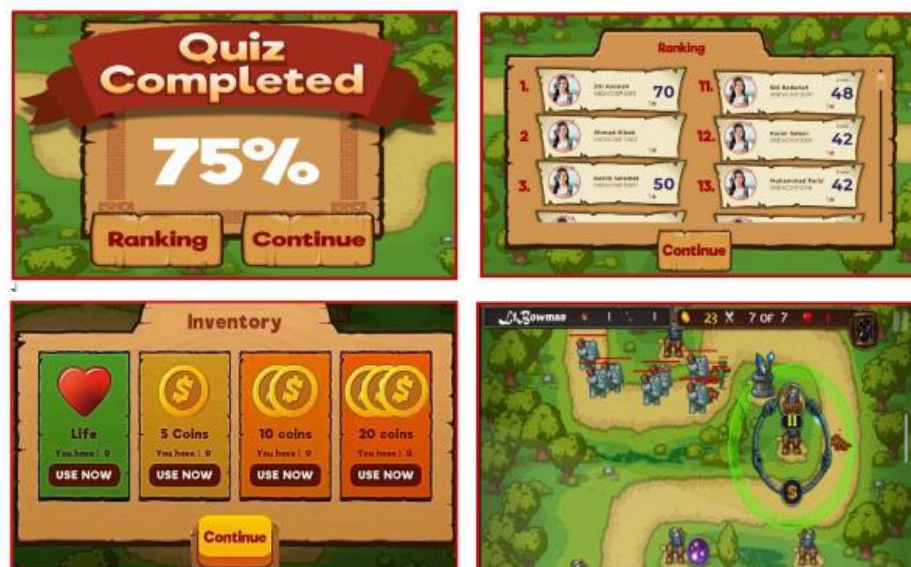
Fig. 4. Interfaces of Students' account in KQ.