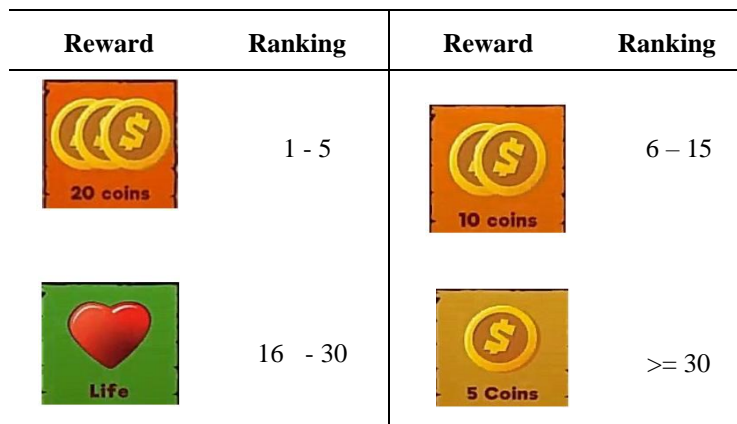
Table 1: List of reward that correspond to the ranking achieved in quiz session.