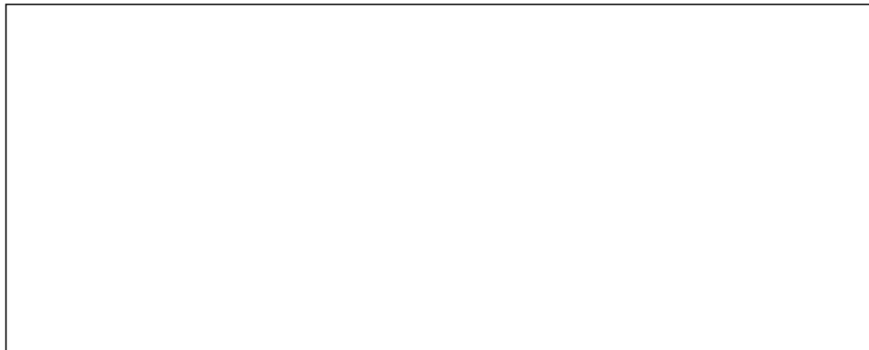
Figure 1: System Architecture of the Home Security Notification System

Figure 1 shows the system architecture depicts the flow of the control. Basically, the system architecture mainly consists of four components which are Raspberry Pi Zero WH, Telegram Bot, smart phone and the sensor devices which are the PIR Sensor, Camera and GPS module. The sensor acts as input device to provide information and deduce through the algorithm. The system is fully controlled by the Raspberry Pi Zero WH microcontroller, and the microcontroller will continuously check the house for any intruders and send a message through the Telegram Bot to the smart phone. Each sensor plays a vital role in detecting intruders like an intruder. The Raspberry Pi Zero WH is able to attach different modules like a camera, GPS module, and a Low Energy (BLE) onboard motion sensors when the system is activated. The main function of the GPS module will dynamically pinpoint the location of the house, and it will send the coordinates of the house to the Telegram Bot with longitude and latitude. Meanwhile, Raspberry Pi Zero WH is able to capture the image of an intruder when the PIR sensor detects any movements.