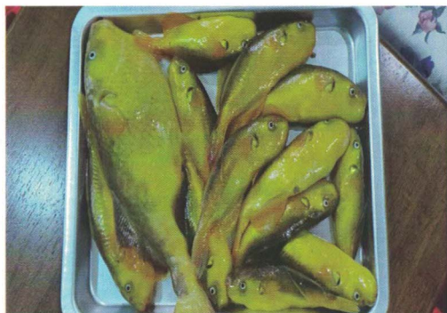
Figure 1: Yellow puffer fish, X. naritus

Yellow puffer fish or Xenopterus naritus (Richardson, 1848) can be identified by the prominent yellowish or golden coloration particularly at the lower part of its body. It has a torpedo-shaped body and widely distributed in China, Thailand, Vietnam, Myanmar, India, Indonesia and Malaysia (Mohd Nor Azman et al. , 2015). In Malaysia, this species can be found abundant only in Sarawak especially in Southwest coast of Sarawak, particularly along the Batang (River) Saribas in Betong, Sarawak (Gambang and Lim, 2004). X. naritus is a migratory species that inhabited coastal waters and areas fringing the mangroves and return to the river to spawn at lower salinity environment. During non-spawning season, the juvenile inhabits coastal water out to the sea.