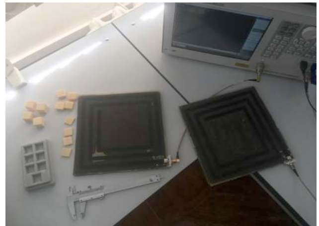
Figure 1. The appearance of strip line structures

The appearance of strip line structures is shown in Figure 1.