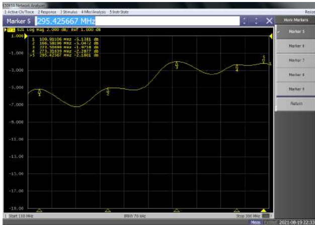
Figure 2. Dependence of power transfer ratio from frequency

transfer ratio (S21) from frequency for distance between structures in 10 mm is shown in Figure 2.