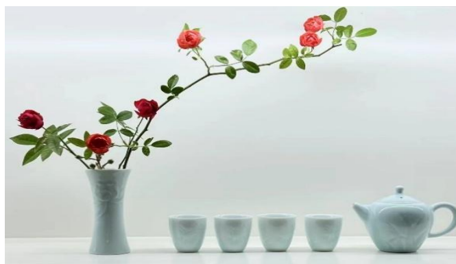
Figure 1. Creative products of functional ceramics

Ceramic cultural and creative products, as a type of arts and crafts product, are ceramic art products that combine practical and aesthetic principles. In the Jingdezhen Ceramic Creative Market, the creative products of college students are mainly divided into two categories, namely "functional ceramic creative products" (Figure 1) and "decorative ceramic creative products" (Figure 2). Usable ceramic creative products are ceramic products aimed at "artistic creation of daily necessities". They mainly embody the beauty of creative handcrafting and are characterized by irregular geometric shapes. In terms of molding technology, they are mostly shaped in the form of blank drawing, clay bar construction, mold pressing, and other forms. Such as tea sets, incense sets, food plates, etc. Decorative ceramic creative products are often expressed in the form of "art life oriented". Usually used as an ornament in daily life, this type of ceramic creative product emphasizes the ornamental, original, and conceptual aspects of ceramic art in terms of artistic expression characteristics. In ceramic decoration, the main techniques are blue and white, underglaze multicolored, high-temperature colored glaze, pink, and new colors. Mainly through personalized expression language, reflecting strong ideological emotions and unique aesthetic sentiment.