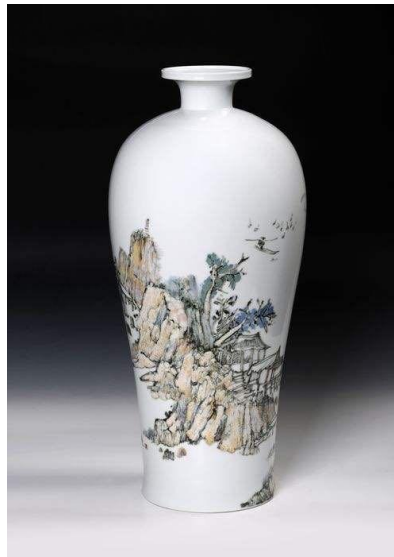
Figure 2. Creative products of ornamental ceramics