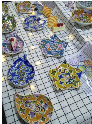
Figure 4. Creative porcelain plate