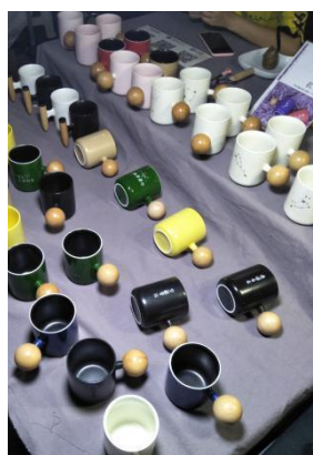
Figure 8. Creative ceramic products combining porcelain and wood