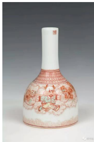
Figure 6. Cattle of Chinese zodiac