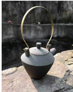
Figure 3. Creative tea sets with practicality as the main focus

integrates into a certain shape space, which not only conforms to human functionalism but also presents a harmonious, smooth, and full aesthetic expression in the work.