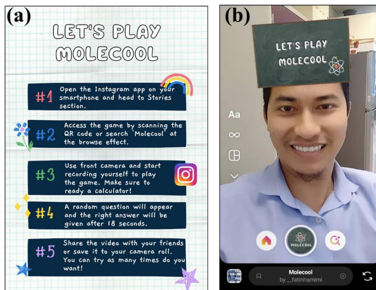
Figure 3. (a) user manual for Molecool game and (b) screenshot of Molecool game.