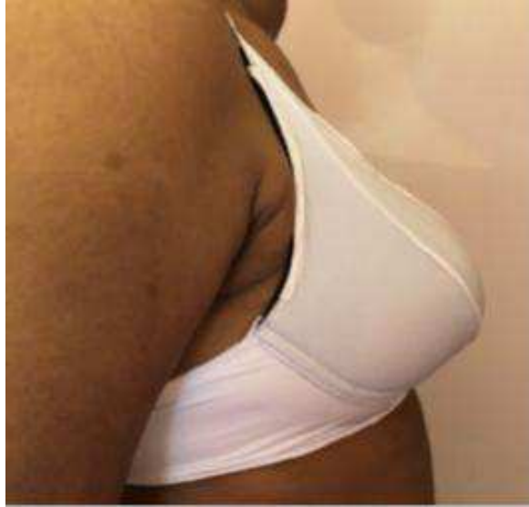
Figure 10. Product fit analysis (side view).

According to the respondents' feedback, the elongated cup apex holds up the breasts in a supportive manner while cut & sewn cup construction feels comfortable compared to the padded cup constructions. Further, the foam sling under the bust area provides an uplift and a support to reduce the breast sagging. The cradle provides support at the bottom of the bust while its coverage helps to add more support to hold the breasts up. The wire casing avoids the irritation caused by the metal wires and feels comfortable against the body. Further, the respondent's added that the fabric of the bra absorbs sweat and no irritation to the skin and feels comfortable to the body.