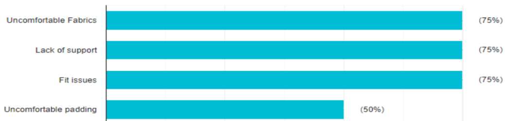
Figure 1. Issues of bras faced by mature women in Sri Lanka.

According to the feedback from questionnaire survey, 75% of the customers complained that the fabrics used in the products are very uncomfortable which will irritate the skin and create perspiration issues ( Figure 1 ). Also the support level of the bras are very much less which will not reduce or avoid breast sagging and they contain fit issues. Nearly 50% of the customers agree that usage of padding in bras cause uncomfortable effect to the wearer.