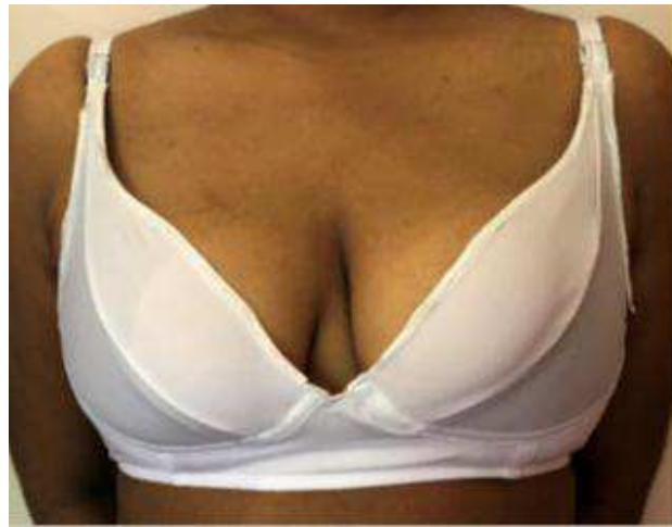
Figure 8. Product fit analysis (front view).

feedback on the constructions and the techniques that have been used to develop the product.