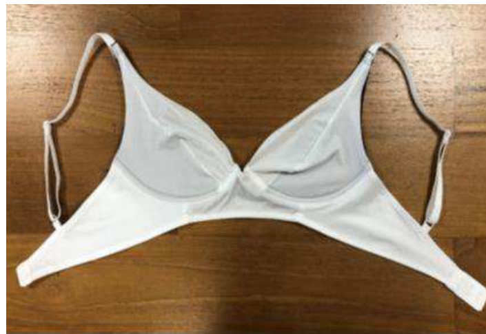
Figure 4. Flat appearance of the product from outer view.