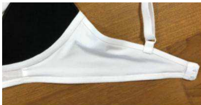
Figure 7. Wing construction (inner view).

The wing was constructed with two fabric ply to provide more support and extended till the mid of the around cup to add more coverage while providing more support and strength ( Figure 7 ). Further, the wing shape was taken as a straight wing to add more hold around the body. The inner panel and the outer panel were attached together using attach outline with elastic to provide more stretchability.