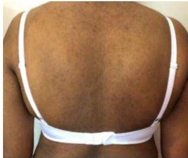
Figure 9. Product fit analysis (back view).