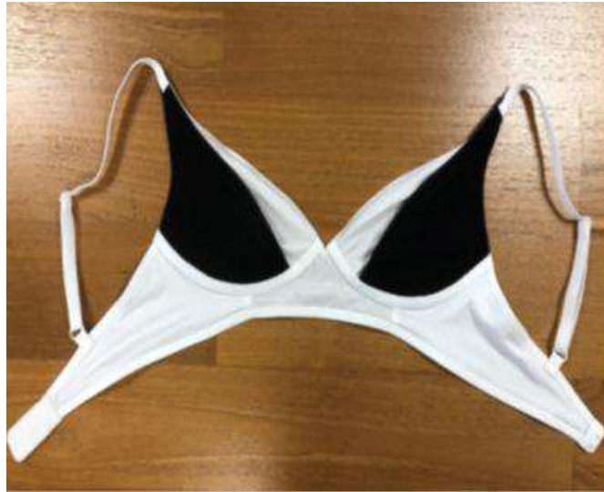
Figure 5. Flat appearance of the product from inner view.