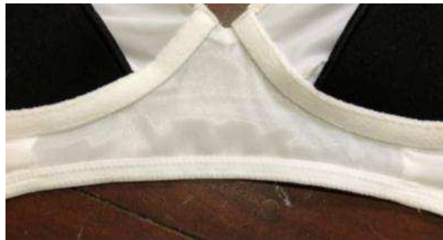
Figure 6. Cradle construction (inner view).

The wing was constructed with two fabric ply to provide more support and extended till the mid of the around cup to add more coverage while providing more support and strength ( Figure 7 ). Further, the wing shape was taken as a straight wing to add more hold around the body. The inner panel and the outer panel were attached together using attach outline with elastic to provide more stretchability.