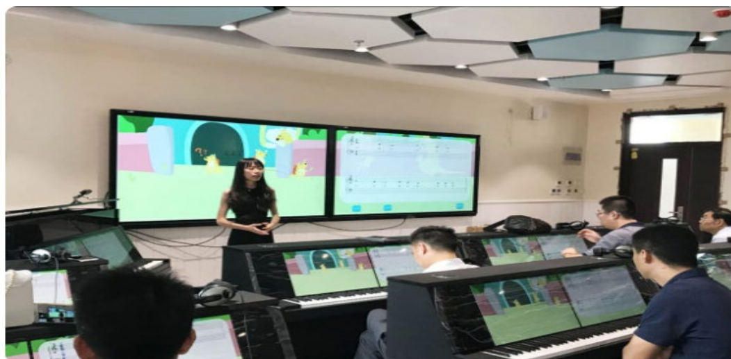
Figure 3 Teaching Process of Intelligent Piano

By using the intelligent piano to teach piano to college students, as shown in Figure 2, the researcher believes that the students will have a better understanding of piano performance and a new understanding of how to teach in an intelligent context nowadays, after having great space and opportunity to further improve their piano and become increasingly proficient in using the special features of the intelligent piano.