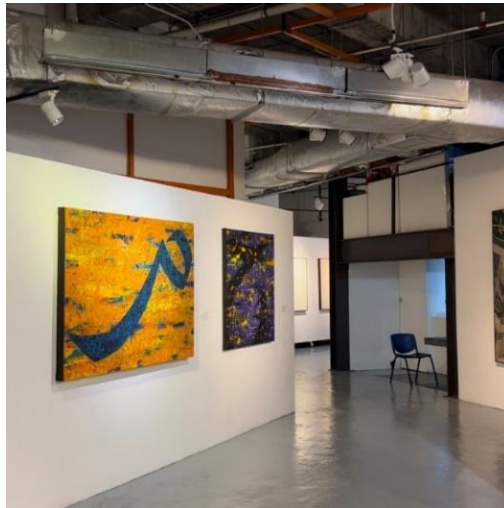
Figure 1. The interior view of Segaris Art Center