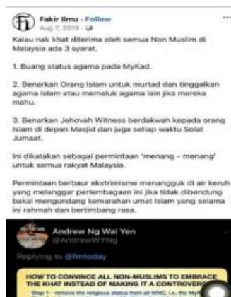
Figure 2: Example of Confusion The Issue of Apostacy