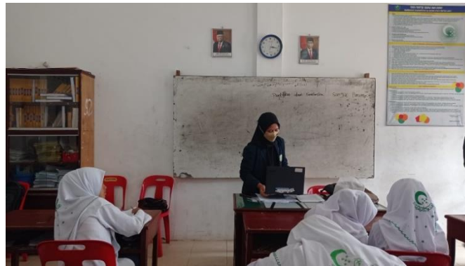
Figure 3 : Explanation of the material using the picture and picture method

After students take the test, the researcher collects the student's test results, after that the researcher explains the material on how to write narrative essays using the media, when explaining the material the students understand carefully, and students carry out discussions among their peers, students look more enthusiastic in understanding the picture narrative essay.