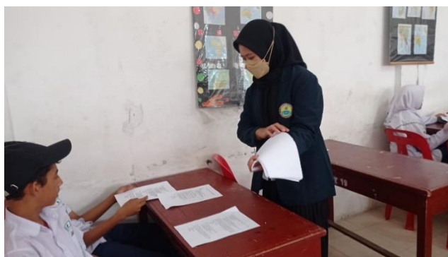
Figure 2 : Practice writing narrative essays before using the Picture and picture method

From the cycle 2 table above, it can be concluded that the grade VII students of MTs pumpkin coast, totaling 25 students, explained that students who achieved a Completed score were 17 people, while students who did not achieve a Completed score were 8 people. The total scores obtained from 25 students reached 1940, and the average obtained from the total values was 77.6. In general, it can be said that the average student score increased by using the picture and picture method compared to using the previous method (lectures).