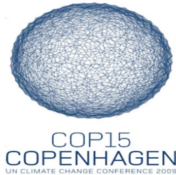
FIGURE 1. The Logo of the 2009 United Nations Climate Change Conference

sheds light on the status of Beard in the story. Obvious in the figure below, the logo can serve as a symbol of the chaotic condition of both Beard's life and global climatic condition. As the story goes on, it is Beard's character that complicates the cosmic chaos. So the logo is an 'objective correlative', in T.S. Eliot's sense of the term, to reflect the confusion in both the microcosmic and macrocosmic represented by Beard's internal and external worlds. As McEwan acknowledges "everything has collapsed around him [Beard] and he knows that Copenhagen will be just the place for him. It is where he would be heading to add his confusion to everybody else's" (Adams 2010).