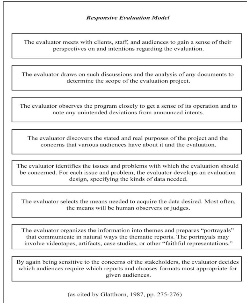
Figure 2. Responsive Evaluation Steps

decide the scope of the evaluation project (Glatthorn, 1987). The steps of responsive evaluation model are illustrated in Figure 2 below.