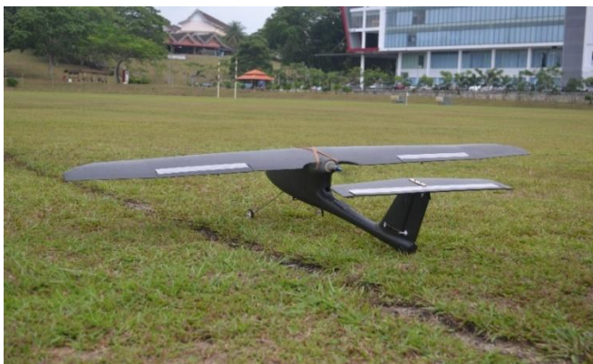
Figure 1 Helang UAV

Classically, GCP is determined by using rapid static technique where the observation take 5 to 15 minutes for every point, radically. Radically means, the point is observer as its own direct to base point and no connection to other points. By applying this technique for establishment of GCP, an accuracy of tens of centimeter level can be achieved.