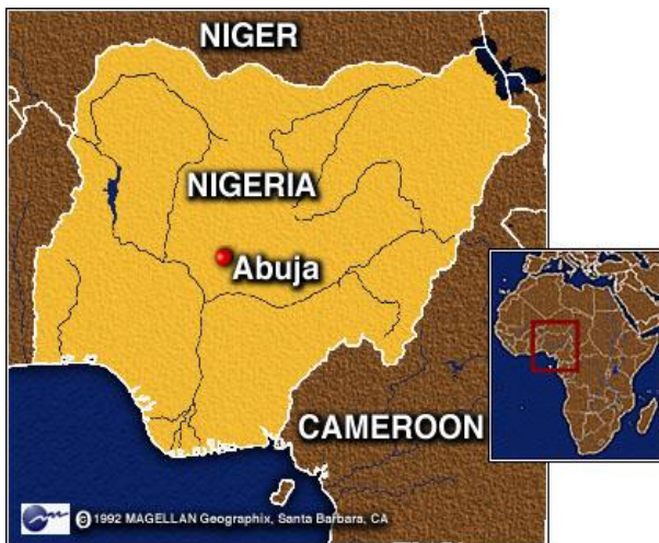
Figure 2 Map of Nigeria showing Federal Capital Territory, Abuja

The Federal Capital Territory (FCT), Abuja became the new administrative capital of Nigeria on 12 th December, 1991. Abuja city is located in the central part of Nigeria north of the confluence of the Niger and Benue Rivers and lies at latitude 9° 07'N and longitude 7° 48' E (Fig 2).