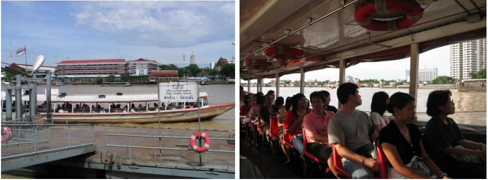
Figures 10, and 11: Riverboats and ferries at Chao Phraya River, Bangkok