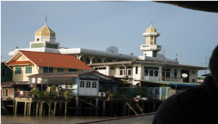
Figure 12: Riverboat and ferries at Chao Phraya River, Bangkok where the visitors and tourists can enjoy the riverscape of Bangkok