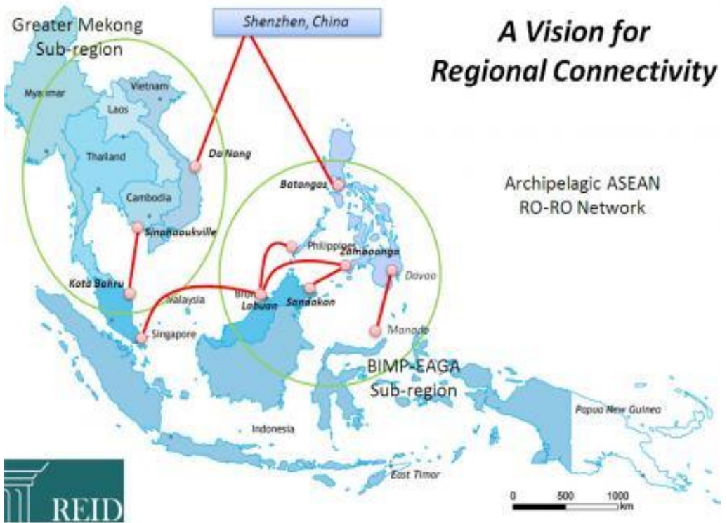
Figure 1: Map of Archipelagic ASEAN RO-RO Network

RO-RO shipping offers a path to increasing intra-regional trade and reducing dependence on extra-regional markets. In the case of the Philippines, RO-RO shipping allows more direct connections throughout the 7,000 scattered islands, increasing competition, reducing the turnaround time and reducing the shipping cost by up to 40 percent (Figures 2, 3, and 4). Apart from that, improving maritime economic corridors will improve the relations among neighbors as well as the flows of trade. The Japan International Cooperation Agency (JICA) has a project for a Maritime Economic Corridor in Southeast Asia, comprising Malaysia, Singapore, Indonesia, Brunei, and the Philippines.