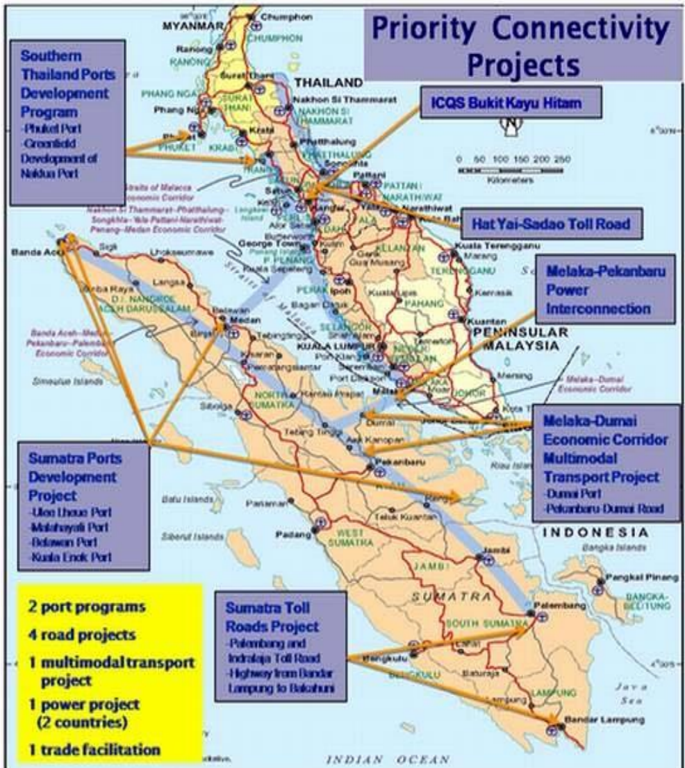
Figure 7: The IMT-GT Priority Connectivity Projects

supports the growing demand for the transshipment of goods and passengers in the Straits of Malacca, as well as recognizes the role of tourism prospects between countries. The new terminal development at Melaka with the state of the art passenger terminal amenities including CIQ facilities may facilitate the movement of Ferry passenger traffic from Melaka to Dumai in Sumatra to encourage tourism.