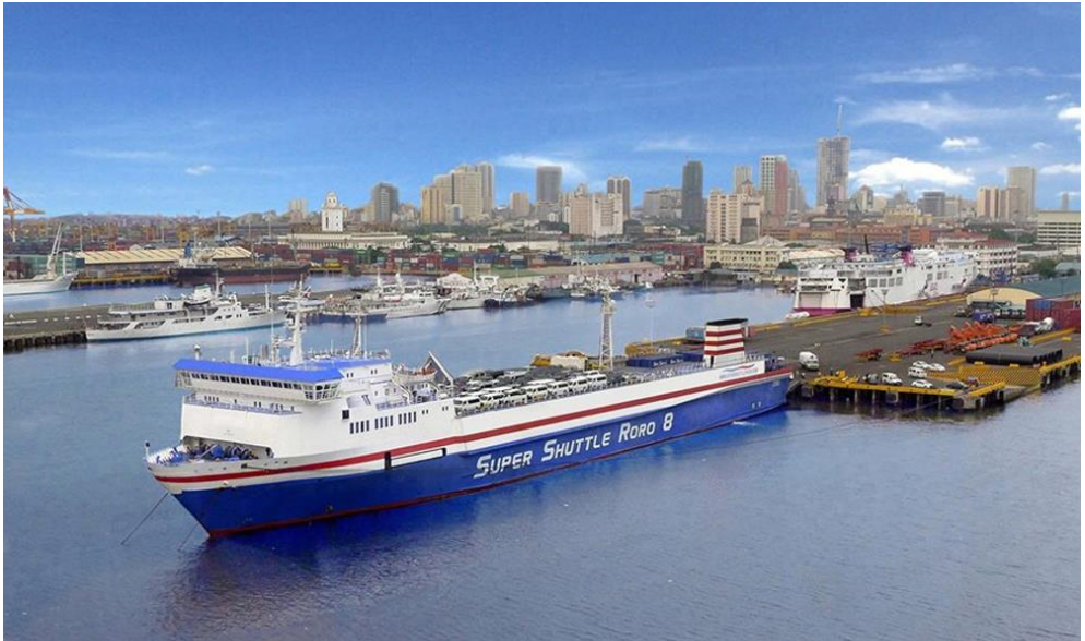
Figure 3: RO-RO vessel, Super Shuttle, Philippines