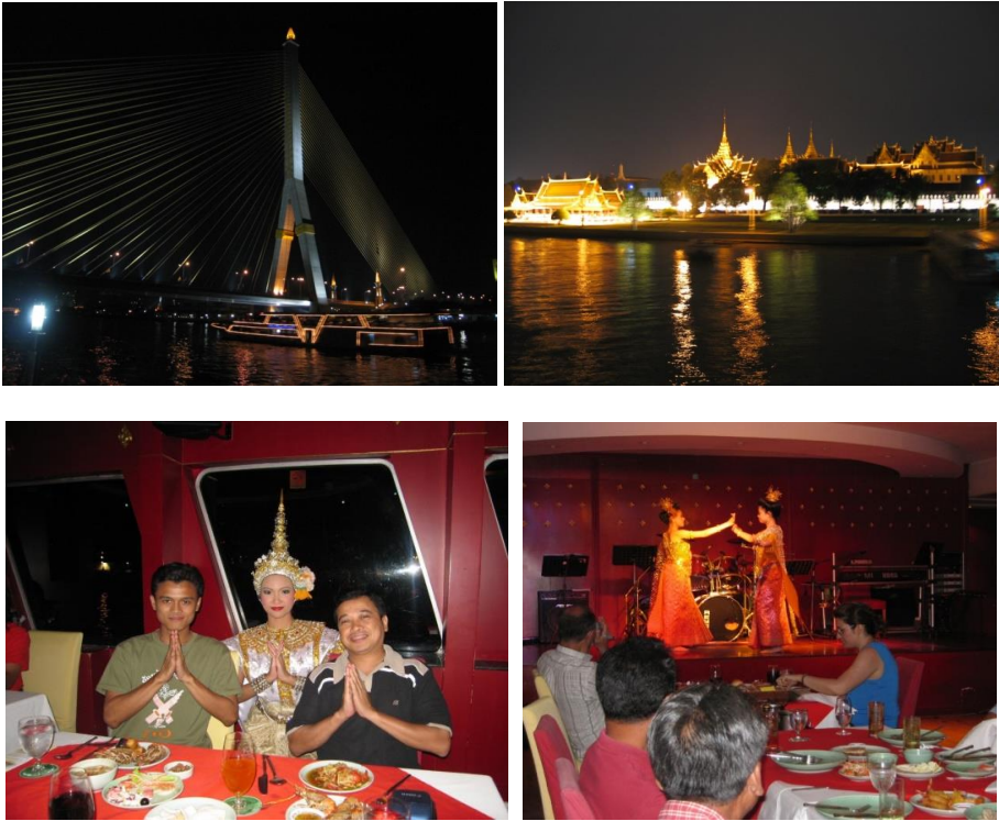
Figures 17, 18, 19, & 20 (from top right to the left): Night River Cruise along Chao Phraya River – Package for Tourism: visitors and tourists can enjoy colorful and spectacular Bangkok in the evening