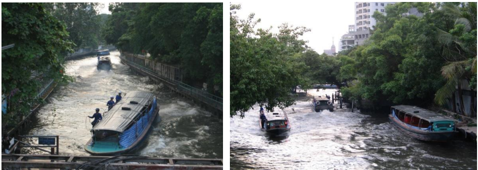
Figures 8 and 9: Boat service at Klong Saen Saeb, Bangkok, Thailand

Thailand possesses great rivers like the Menam Chao Phraya. It is the largest watershed in Thailand, and covers approximately 35 percent of the nation's land. Several canals, also known as "Klong", have been made in the past, shortening the trip from the city to the sea. Boats are a great way to get around the famous Riverside area with its many historical attractions, temples, and architecture, and also to explore the "klongs" (canals) for a glimpse of Bangkok from yesteryear (Figures 8 & 9). Several kinds of boats (express boats, river taxis, and tail-boats) run up and down the Chao Phraya River connecting with the local suburbs on the Thonburi side and along the river, while ferries can be used to cross the river at various points (hotel.com [n.d.a]). Stretching west to east across the map of Bangkok, Klong Saen Saeb begins in the Old City, near the Mahakhan Fortress at the end of Ratchadamnoen Road, and runs all the way to Chachoengsao Province, where it ends by flowing into the Bang Pa Kong River. It cuts through central areas like Phayathai, Pratunam, Chitlom, Nana, Asok Road, Thonglor, and Ekkamai, running parallel to the Phetchaburi and New Phetchaburi Roads, before turning up Ramkhamhaeng Road and on to Bangkokkapi (Figures 10, 11, & 12) (hotel.com [n.d.b]).