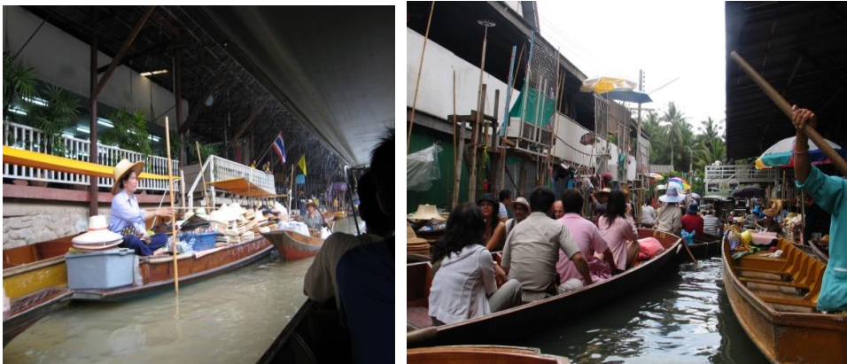
Figures 15 and 16: Exploring water as heritage – mode of transportation and livelihood for income sources – traditional market and floating market