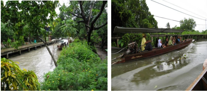
Figures: 13 and 14: Appreciating canals as a traditional mode of transportation in Thailand