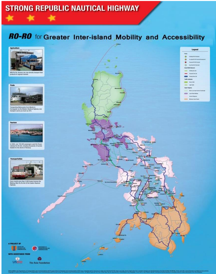
Figure 2: RO-RO for greater inter-island mobility and accessibility in the Philippines