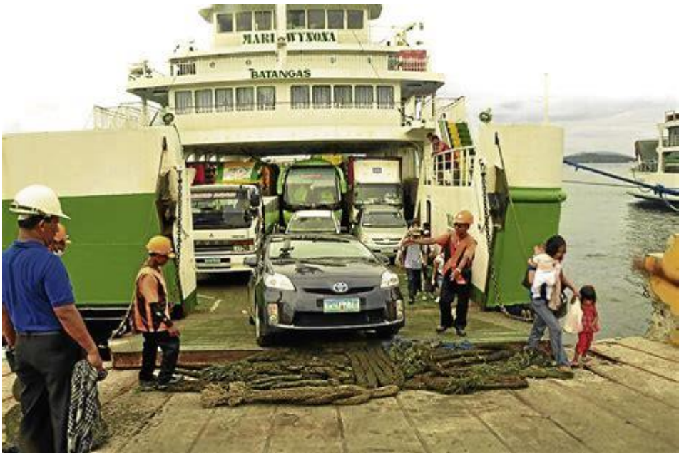
Figure 4: Ro-ro vessel transporting vehicles, Manila Port, Philippines