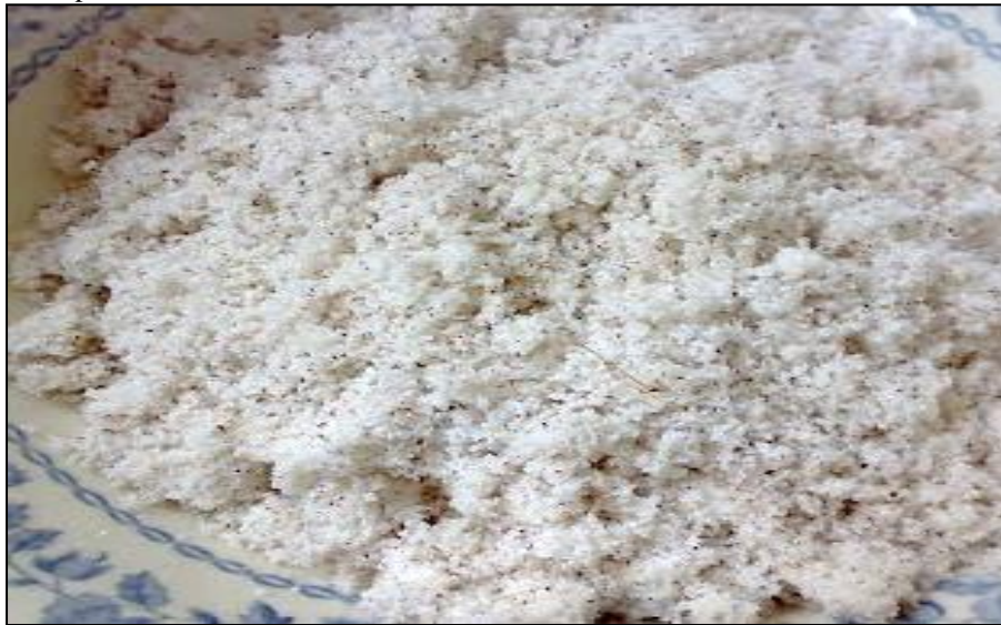
Fig.1 Coconut Meat Husk Fibers

chemical treatment for 1 hour and 24 hour duration of treatment. Then the treated fiber will be drain from any excess chemical then were dried in oven at 50°C for total of 24 hours. The composites were fabricated by using vacuum bagging method at 15 psi. Fiber volume fraction for all specimen were at 15% for 200 mm (L) x 150 mm (W) x 3 mm (T) flat mould, that is 14.45 gram weight of fiber, 65.79 gram of polyester and 1.64 gram of hardener. The flat mould were prepared by using aluminium sheet and double sided tapes as the side wall in size of 200 mm (L) x 150 mm (W) x 3 mm (T).