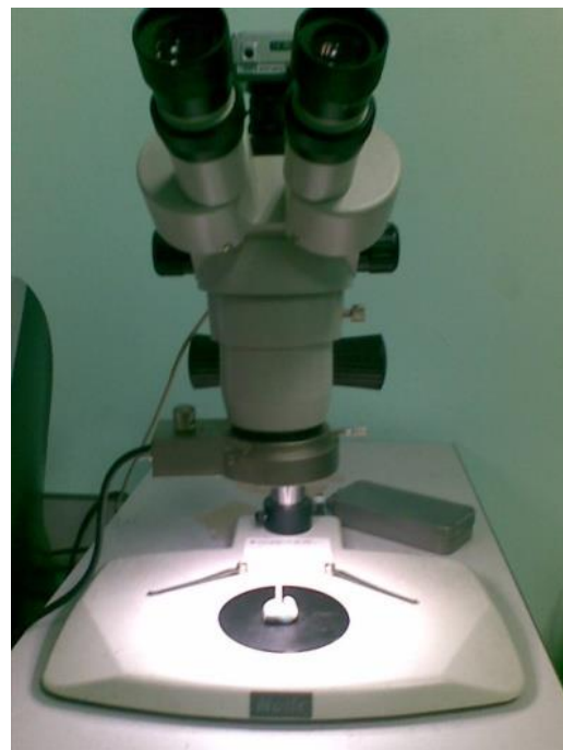
Fig. 3 Tool maker microscope

Delamination as shown in Fig. 2, is measured using a tool maker microscope (Fig.3).