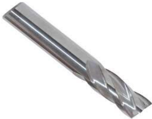
Fig. 1 Flat end mill

Milling experiments were performed on an HAAS CNC milling machine and flat end mill used was made of HSS and have a diameter of 6 mm as shown in Fig. 1.