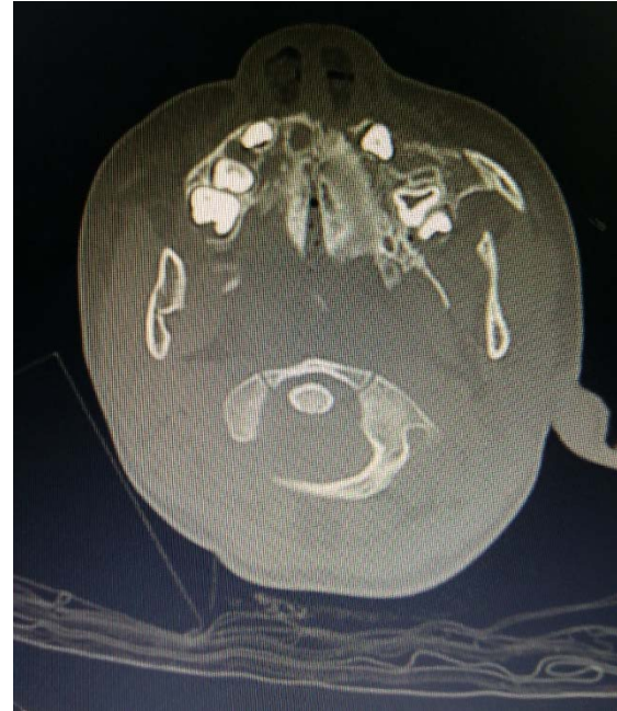
Figure 2. Axial view showing fracture at the posterior palatal region, ending at nasopalatine foramen

Fort 1 maxillary fracture with incomplete palatal fracture involving posterior part of the palate (Fig. 2). The patient was ventilated in the intensive care unit and was extubated two days later. He was discharged well from hospital after one week of admission.