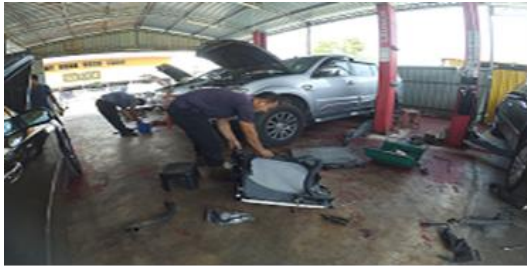
FIGURE 2. Observation at the workshop