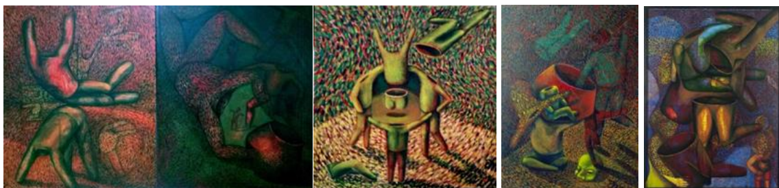
Figure 3 The Post-Doctoral Project, the series of 'Spiritual Identity: The Overlay of Memories No. 5 - 8', 2013 - 2017, various sizes, acrylic and ballpoint pen on canvas (left to right)