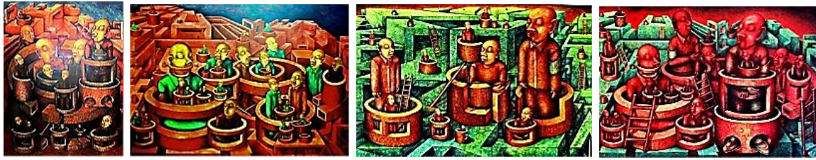
Figure 1 The Pre-Doctoral Project, the series of 'Faith and belief: Assembly of Love No. 1- 4', 2007 - 2008, 150 x 180 cm, 162 x 245 cm, acrylic and ballpoint pen on canvas (left to right)