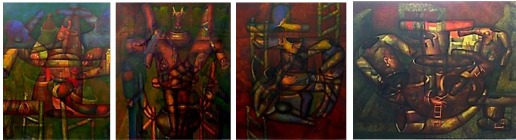
Figure 2 The Doctoral Project, the series of 'Spiritual Identity: The Overlay of Memories No. 1 - 4', 2009 - 2012, 150 x 180 cm, acrylic and ballpoint pen on canvas (left to right)