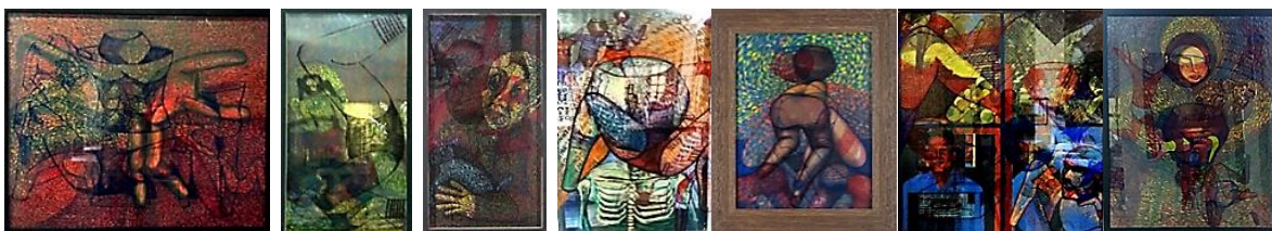
Figure 4 The Recent Project, the series of 'Spiritual Identity: The Overlay of Memories (Endless) No. 1 - 8', 2017 - 2018, various sizes, mixed media (left to right)